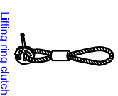
Lifting ring duct

Each headwall is cast with an opening to suit the outside diameter of the pipe being used at the invert height required. Size of hole shown in backwall is indicative only.