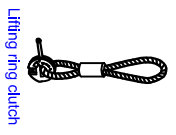
Lifting ring clutch

Each headwall is cast with an opening to suit the outside diameter of the pipe being used at the invert height required. Size of hole shown in backwall is indicative only.